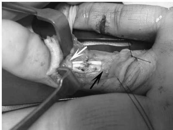
FIGURE 2. Preoperative image showing a pulley plasty for A2 (black arrow) and A4 (white arrow).

No contraindications for this technique exist. However, a part of the pulley must obviously still be inserted on the phalanx. The technique is not possible to perform in a tenolysis when the pulley has disappeared. In this case, reconstruction of the pulley is necessary, aided by classic techniques. 9